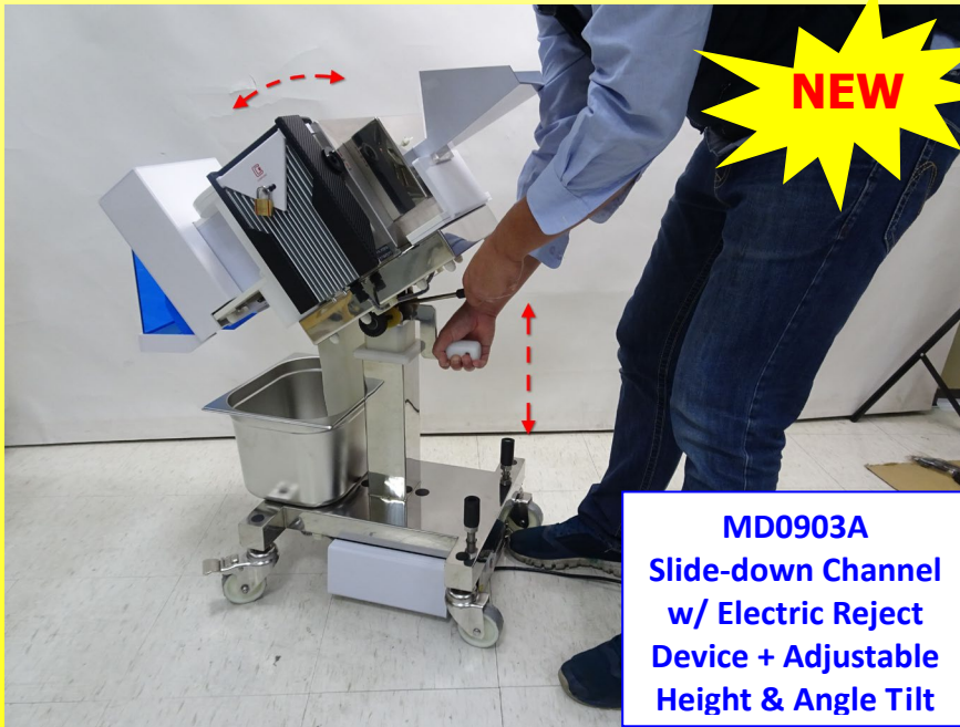
NEW MD0903A Slide-down Channel w/ Electric Reject Device + Adjustable Height & Angle Tilt

Sensitivity: FE 0.25mm 316SUS 0.5mm CU 0.4mm