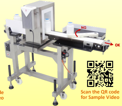
測瓶裝 Bakelite Platform for Testing Bottle

Sensitivity: FE 0.25mm 316SUS 0.5mm CU 0.4mm