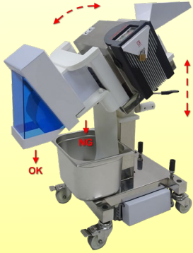
可升降調角度 Slide-down Channel with Adjustable Height & Angle Tilt